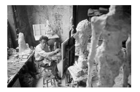
Alberto Giacometti's studio

Mod roc is another name for plaster impregnated bandage, and it can be used to make sculpture. Mod roc starts off dry, you then dip it in water and then model with it.