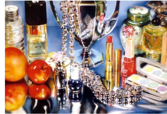
Audrey Flack (Realism)