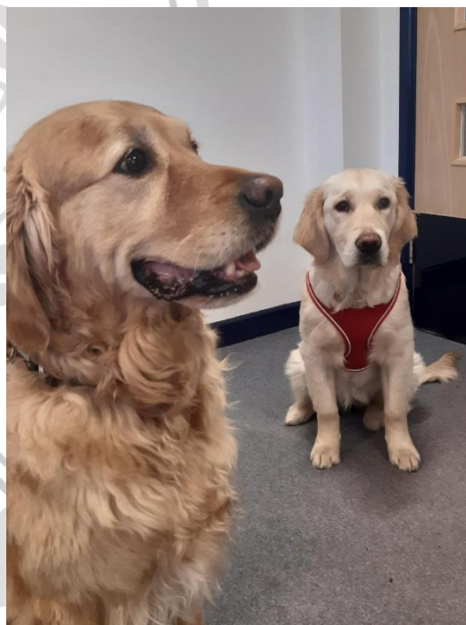
Scoot showing Cleo the ropes on her first day.

Training is hard work for a puppy but also a lot of fun. When pupils see Cleo around school they must remember to be calm allow her space. But when Cleo comes to say hello, she loves a tickle under her chin or a quick belly rub!